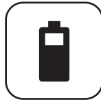
Battery Level Indicator